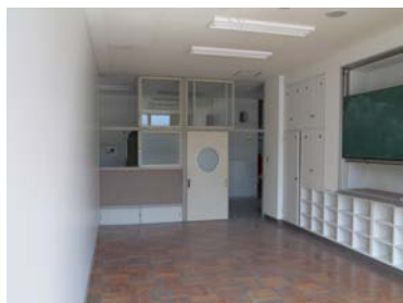
Studio Space A