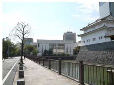
Rear (next to castle watchtower)