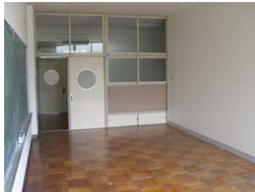
Studio Space B