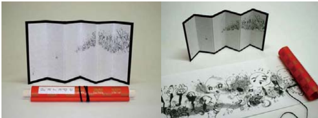
Shiriagari Kotobuki × Osada Bunkado "parade"

Manga artist Shiriagari expresses Ma through a parade in scroll form.