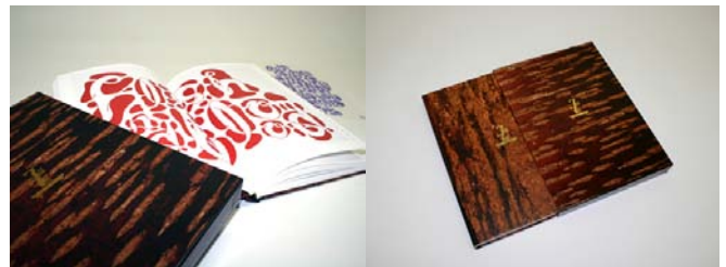
WABISABI × Syoubunsha Printing "WABISABI 1999-2008"