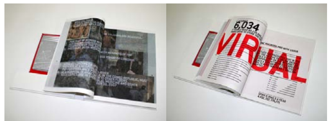
so+ba × Kyoshin Printing "24.10.2008 un world day"