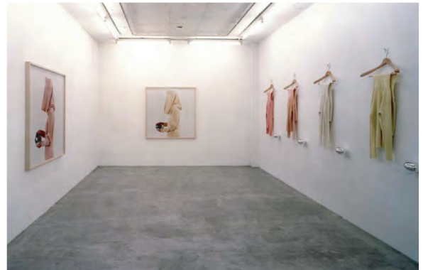
Katy Lied 1999