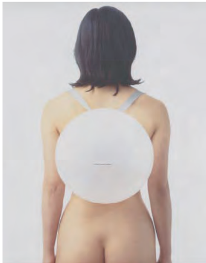
Pitcher's Mound Rucksack for Abo 1997

I have worked with a fascination of "pictorial art". But I am most interested in the edge of pictorial art. I hope to fully bring forth into the artwork the world that I look upon. If pictorial art is the representation of human perception, then by taking away the frames of artwork one is also doing the same with the borders of human perception. Its the perspective edge where only the limits of clear artwork and that of regular vagueness can be recognized. It is with these two points which can never overlap that my models of "ideal pictorial art" are produced.