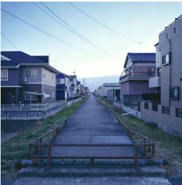
Drain -Culvert Scenery- 1200x1200mm Lambda Print 2005

Dates: 2008.6.7 Sat. – 6.28 Sat.(closed sundays and holidays)