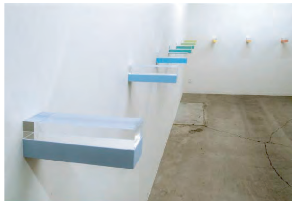
Drain IV 2003